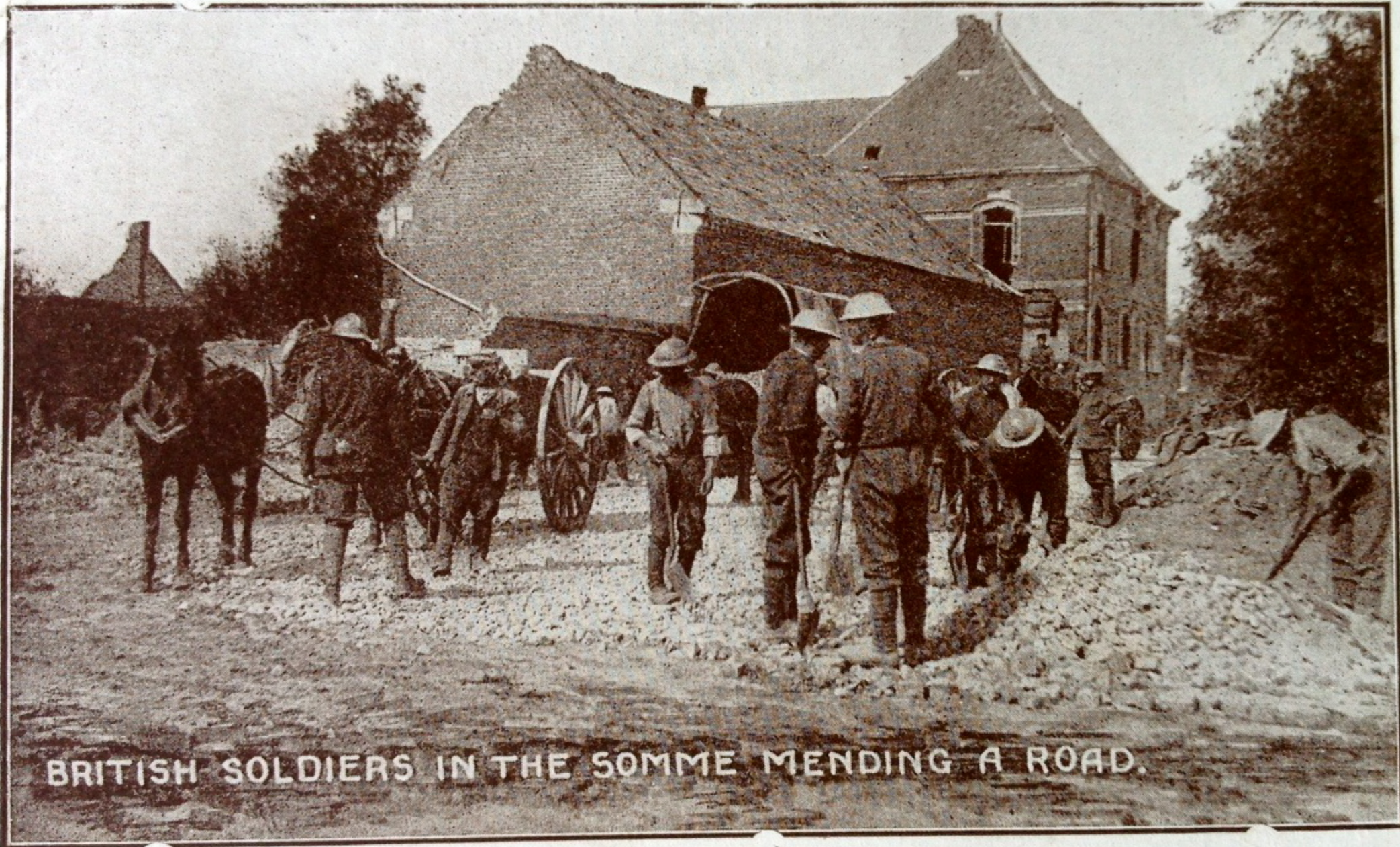
BRITISH SOLDIERS IN THE SOMME MENDING A ROAD.